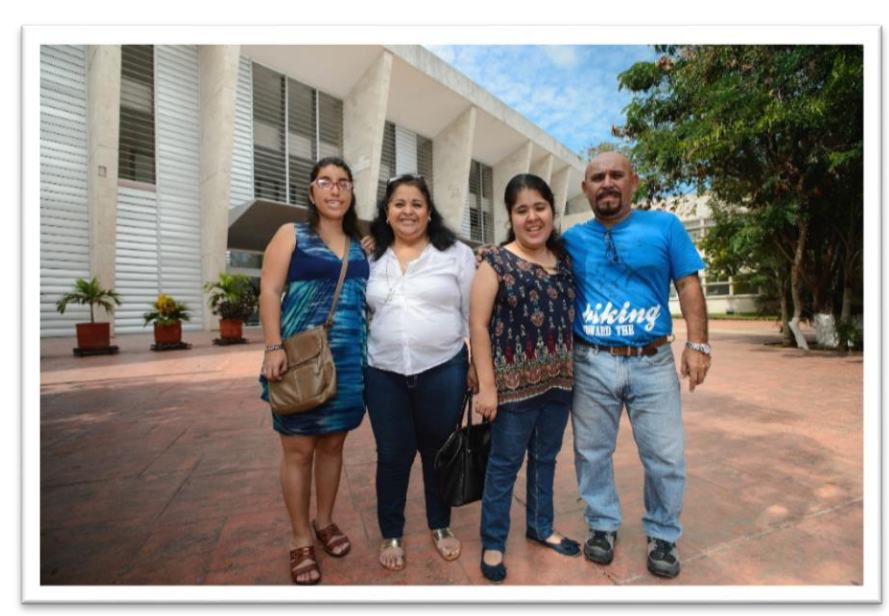
A family poses in front of the hospital where their daughter with an intellectual disability received treatment through the Special Olympics Healthy Communities program in Mexico

The Special Olympics Sibling Engagement Program does not only benefit your children. It also has positive implications for the entire family.