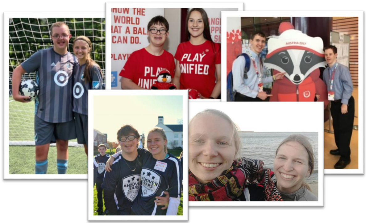
Siblings from around the world with and without intellectual disabilities participate in Special Olympics

Sibling engagement occurs when the sibling of a person with ID is actively involved in their brother or sister's life. They are active participants in their sibling's Special Olympics journey. Together, they play, learn, develop and work. They make their relationship stronger in the process. The siblings are a team who motivate and support each other. They work toward and achieve shared and personal goals. Learn more about how Special Olympics can foster sibling engagement <a href="here">here</a>! Learn more about how sibling engagement can benefit the entire family in Appendix A!